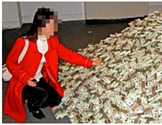
(http://comparisons.org/the-home-refinancing-plan-banks-don-t-want-you-knowing.php?aff=1443) North Dakota Homeowners Who Have Not Missed A Payment in 3 Years Are In For