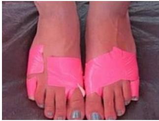
(http://princetonnutrients.com/cmd.php?ad=746366) The 4 stages before a heart attack. Are you at risk? (http://princetonnutrients.com/