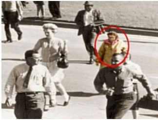
(http://lifehacklane.com/browse/?id=609&utm_source=adblade&utm_medium=...) 10 Mysterious Photos That Cannot Be Explained (http://lifehacklane.com/browse/