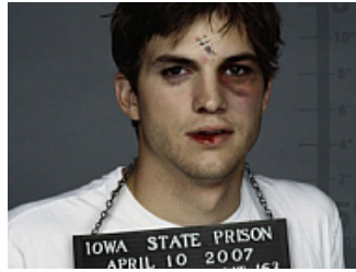
(http://adrzr.com/i42?utm_medium=cpc&utm_campaign=e42-2_US_desktop_CrimesAshtonK6.9_1_i...&utm_term=...) [EncodedAdbladeTracker] 15 Famous Celebs Who Have Committed Horrible Crimes (http://adrzr.com/i42?