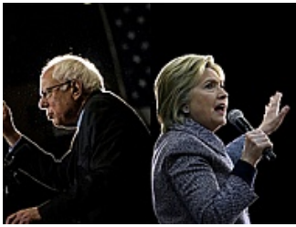
(https://ad.doubleclick.net/ddm/clk/3026...http://www.ft.com/cms/s/2/2ca82066-f4eb-11e5-803c-d27c7117d132.html?ftcamp=engage/ext_display/USPolitics//...) Bernie Sanders' supporters on Reddit have raised $2.3m for his campaign.