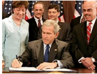
(http://pro1.oxfordclub.com/494352/) 2001, Bush gave Americans $300 to $600 checks. Now Obama is giving out cash