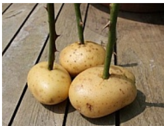
(http://www.trendingmoms.com/15-quick-and-easy-gardening-hacks/?utm_source=adblade&utm_medium=rel...) 15 Incredible Gardening Tricks to Impress Your Neighbors (http://www.trendingmoms.com